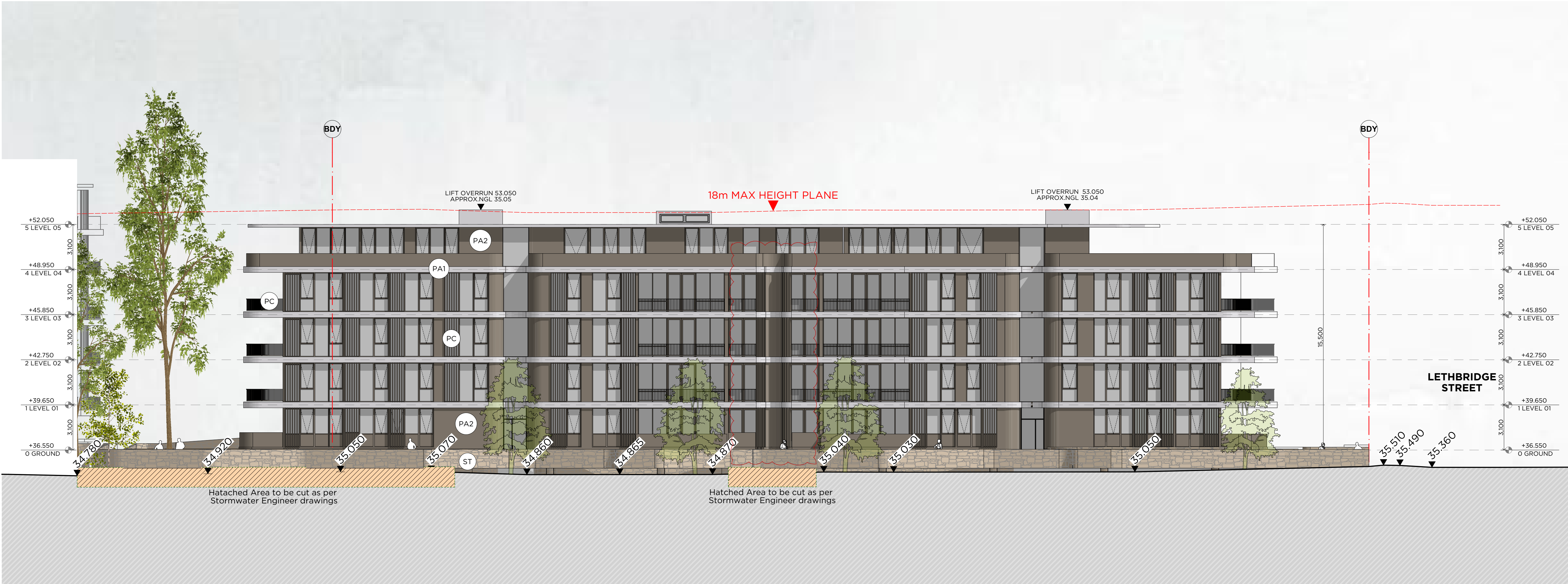
BLDG B EAST SCALE 1:150