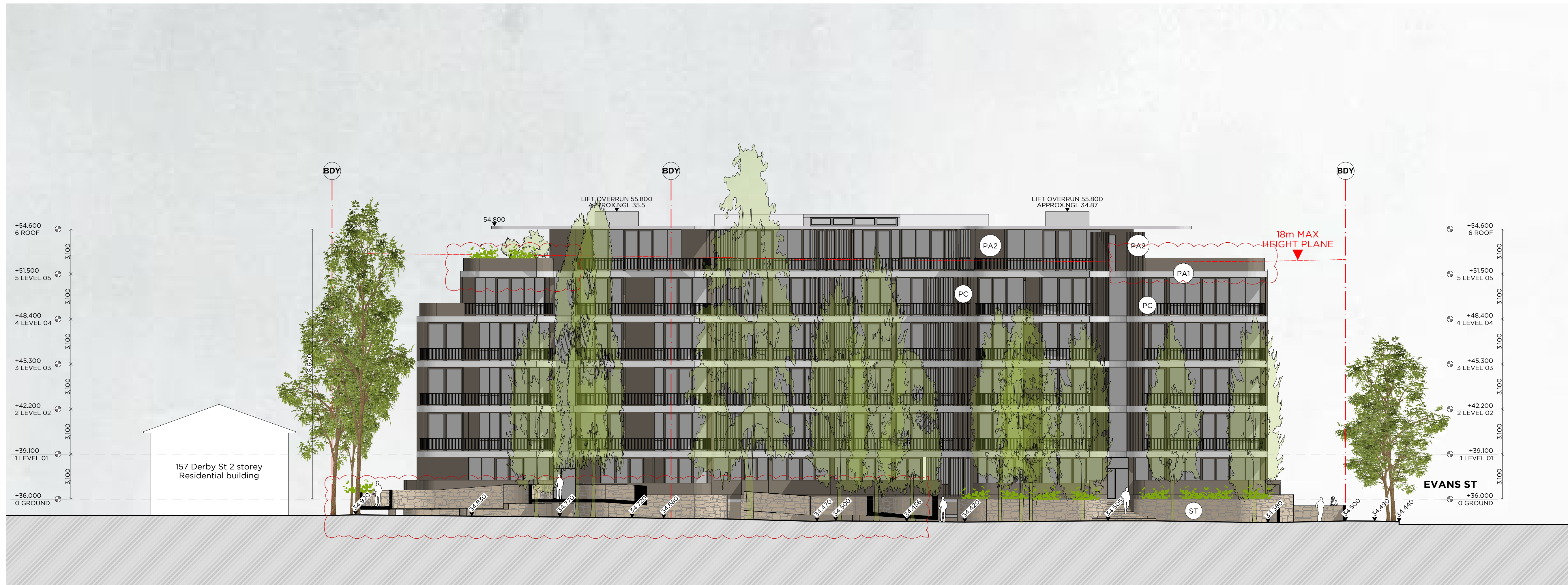
BLDG A NORTH SCALE 1:150

Fixtures - All dwellings - Shower heads 4" (>4.5 but-6L/min) Flushing Toilet system - 4" All Kitchen Taps 3" All Bathroom taps 3" All dishwashers 4" Hot water system - gas instantaneous 6" Bathroom ventilation system - individual fan, ducted to facade or roof manual switch on/off Kitchen Ventilation system - individual fan, ducted to facade or roof manual switch on/off Laundry ventilation system - individual fan, ducted to facade or roof manual switch on/off Cooling - 1 phase airconditioning living areas 1 phase airconditioning Bedroom areas Heating - 1 phase airconditioning living areas 1 phase airconditioning Bedroom areas Kitchen - gas cooktop & electric oven. For details refer to Basix Certificate.