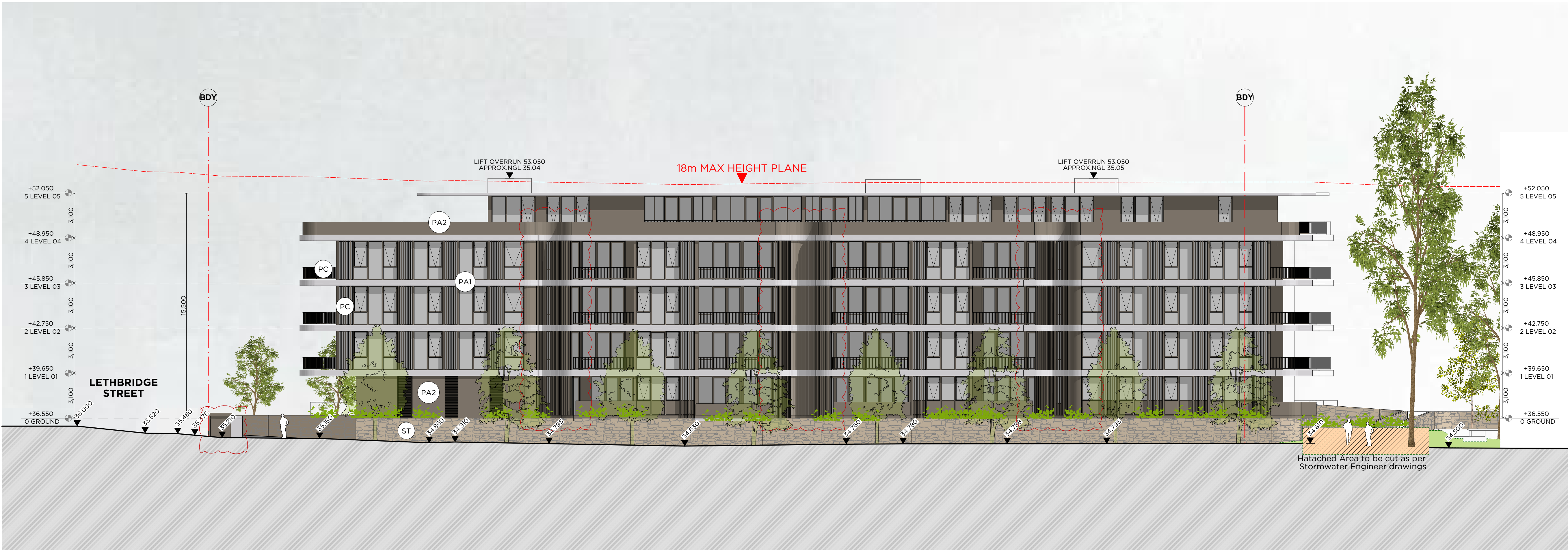
BLDG B WEST SCALE 1:150