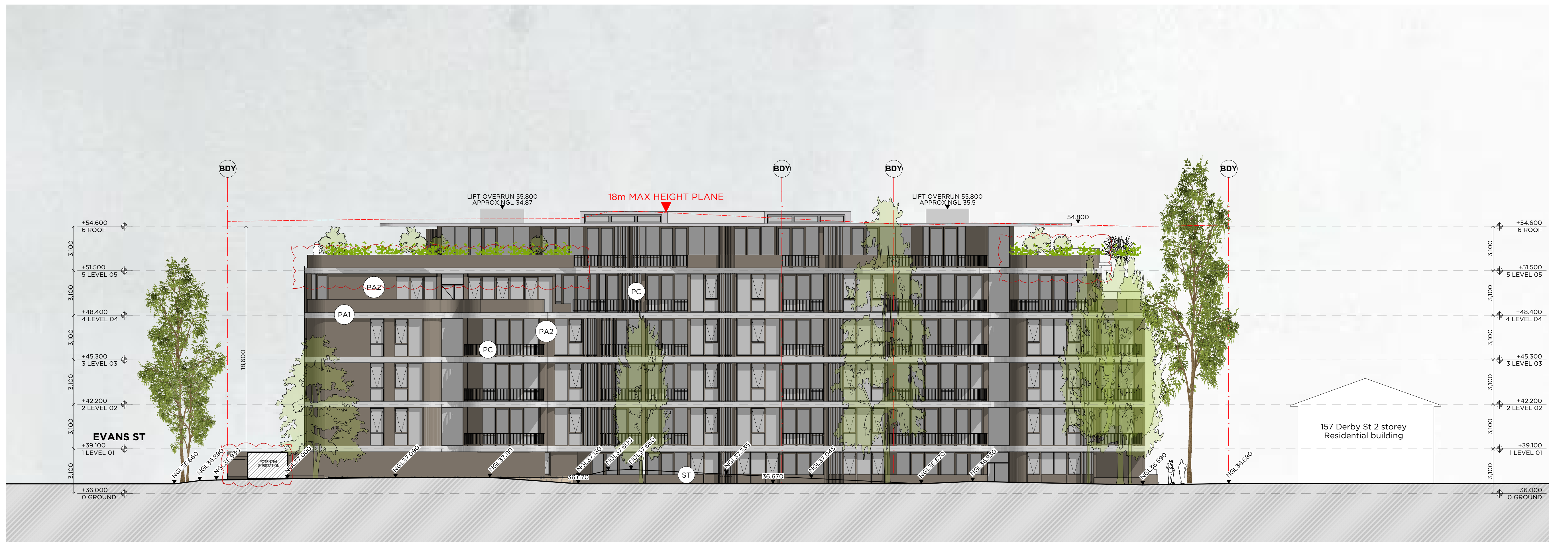
BLDG A SOUTH SCALE 1:150