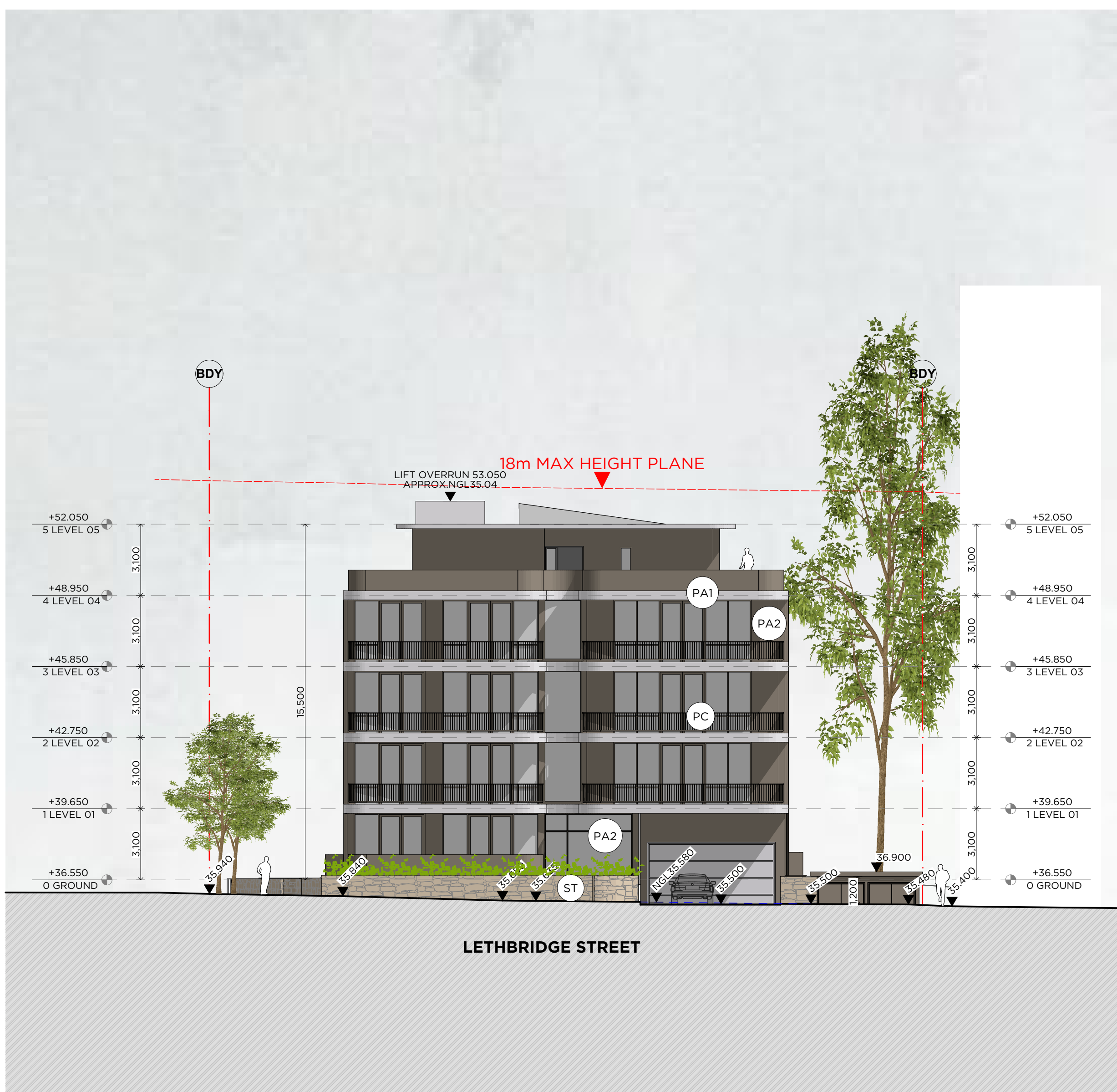
BLDG B NORTH SCALE 1:150