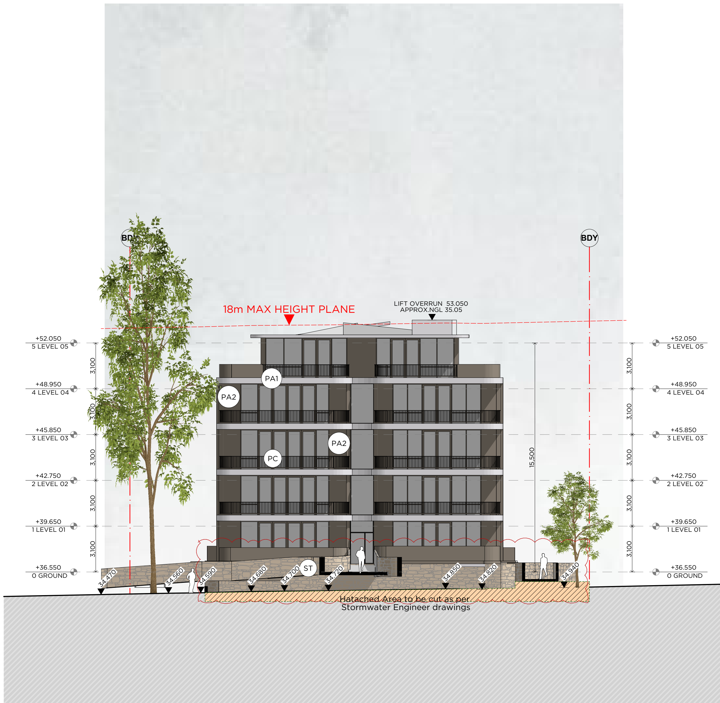
BLDG B SOUTH SCALE 1:150

BASIX BASIX REQUIREMENTS Fixtures - All dwellings - Shower heads 4" (>4.5 but<6L/min) Flushing Toilet system - 4" All Kitchen Taps 3" All Bathroom taps 3" All dishwashers 4" Hot water system - gas instantaneous 6" Bathroom ventilation system - individual fan, ducted to facade or roof manual switch on/off Kitchen Ventilation system - individual fan, ducted to facade or roof manual switch on/off Laundry ventilation system - individual fan, ducted to facade or roof manual switch on/off Cooling - 1 phase airconditioning living areas 1 phase airconditioning Bedroom areas Heating - 1 phase airconditioning living areas 1 phase airconditioning Bedroom areas Kitchen - gas cooktop & electric oven. For details refer to Basix Certificate.